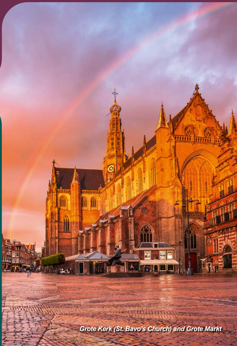
Grote Kerk (St. Bavo's Church) and Grote Markt