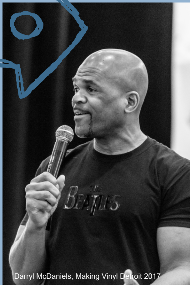
Darryl McDaniels, Making Vinyl Detroit 2017

THE MAKING VINYL CONFERENCE UNLEASHES THE RHYTHM OF INNOVATION - WHERE GLOBAL LEADERS CONVERGE TO SHAPE THE FUTURE OF THE VINYL RECORD INDUSTRY.