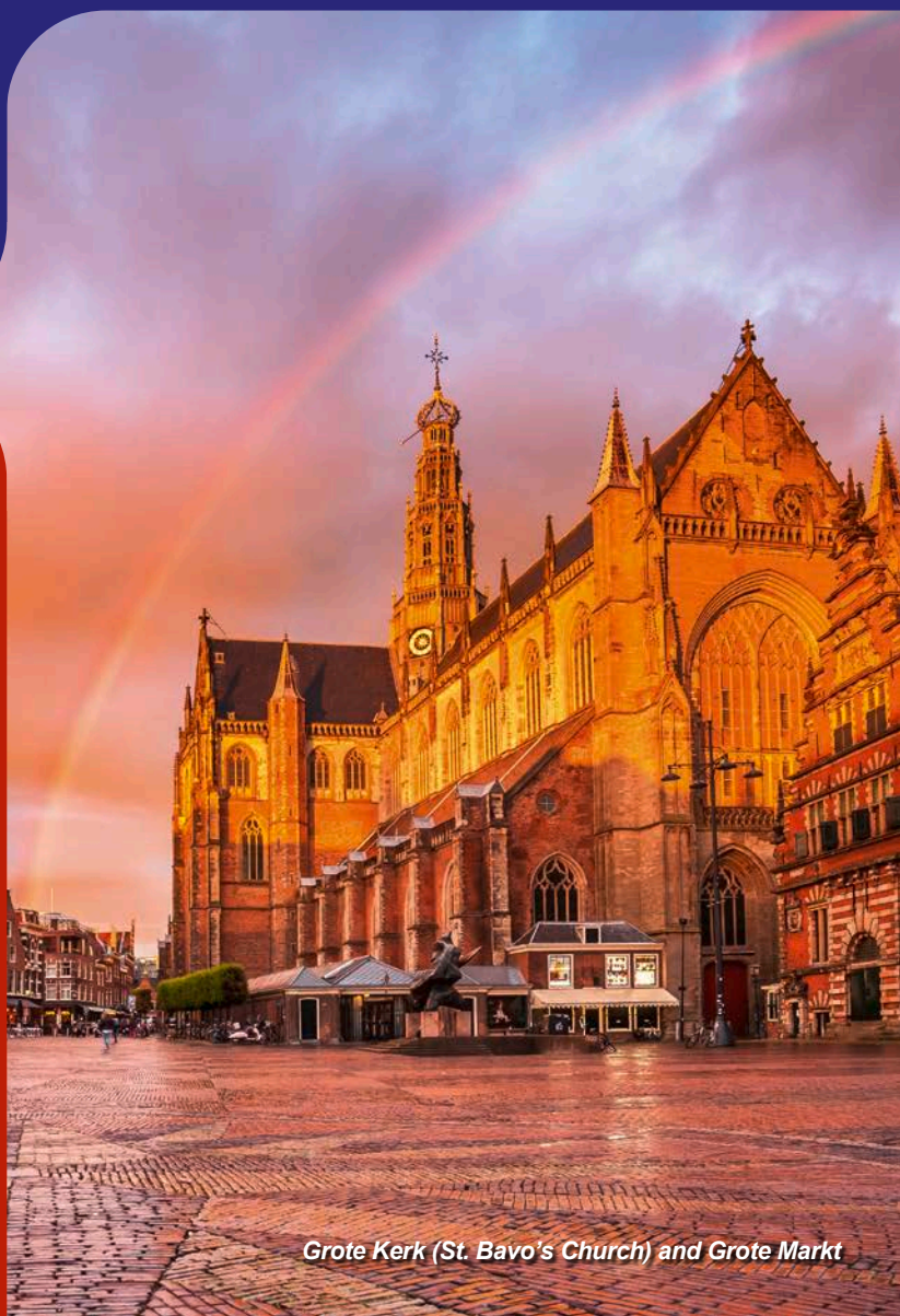
Grote Kerk (St. Bavo's Church) and Grote Markt